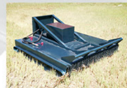
35. Square Lawn Mower