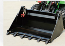
4. Four in one Bucket