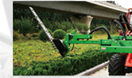
39. Hedge Trimmer