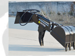
23. Mini Digger