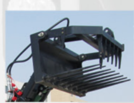
15. Hay Fork