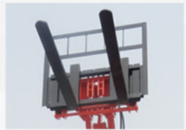
10. Pallet Fork B