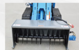
20. Trench Backfiller