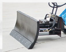
28. Dozer/Snow Blade