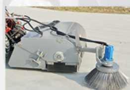
31. Closed Sweeper