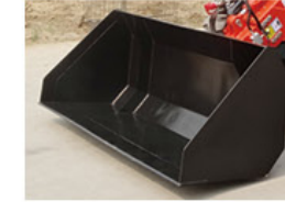
5. Snow Bucket