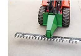
38. Cutting Bar B