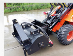
36. Rotary Mower