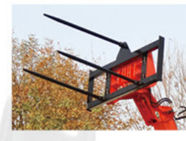
17. Bale Fork