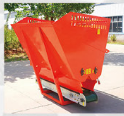
64. Bedding Distributor Bucket