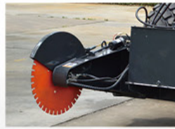
59. Rotary Saw