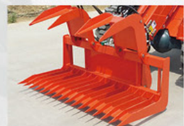
16. Manure Fork