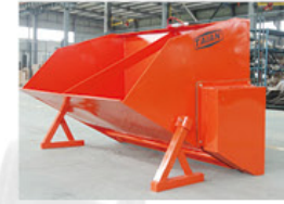
33. Sand/Salt Spreader

*Optional with hydraulic adjusting directions.