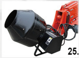
25. Concrete Mixer