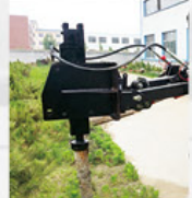
27. Post Hammer