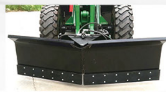
29. V-Snow Blade