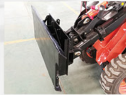
58. Bobcat Quick Coupling Adapter