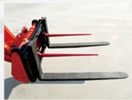
9. Pallet Fork with Tines