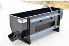
63. Auger Bucket