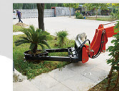
40. Pot Grabber