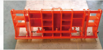
62. Euro VIII Quick Coupling Adapter