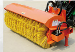
30. Open Sweeper

*Independent Close-Open function is optional.