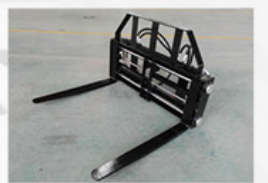
12. Hydraulic Adjustable Pallet Fork