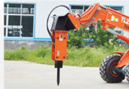
26. Hydraulic Hammer