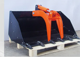
3. Grapple Bucket