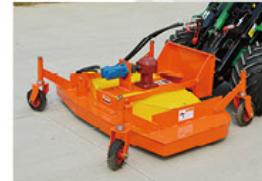
34. Lawn Mower