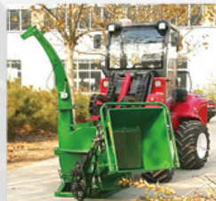
65. Wood Chipper Attachment