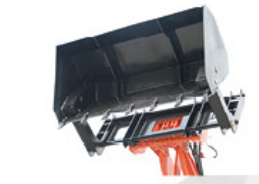
6. High Tip Bucket