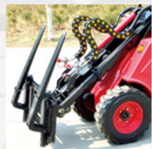
11. Collapsible Pallet Fork