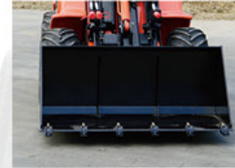
1. Standard Bucket