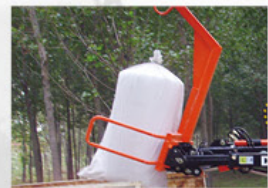
14. Big Bag Mover