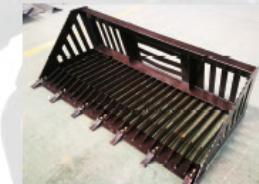
7. Stone Bucket