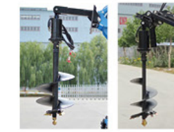
*Optional Auger Bits :

*Standard auger bits' length is 1200mm, please confirm with us if any different requests.