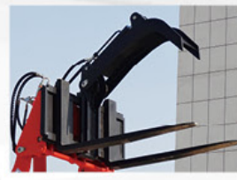
13. Grapple Forklift