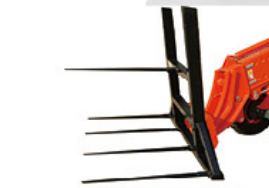
18. Silage Bale Fork