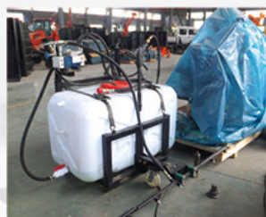
61. High Pressure Washer