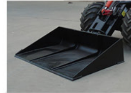
2. Leveler Bucket