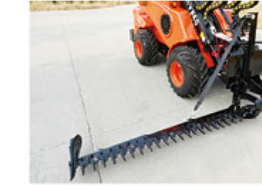
37. Cutting Bar A