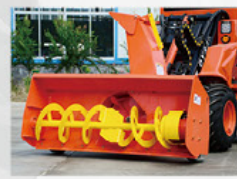
32. Snow Blower