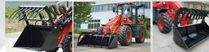
19. Silage Bucket Grapple